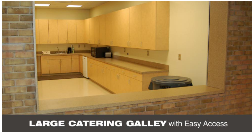
LARGE CATERING GALLEY with Easy Access

Visit Register.MiamiTwpOH.gov or call (513) 248-3727